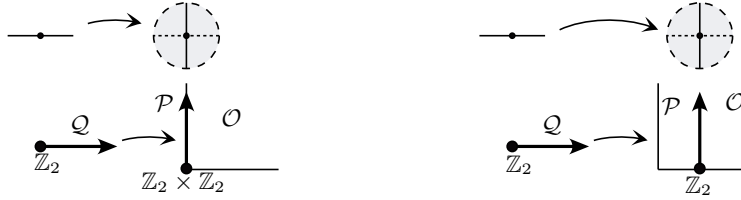
FIGURE 1. Examples 8 and 9

Example 8. Let \mathcal{Q} = \mathbb{R}/\mathbb{Z}_2 be the smooth orbifold (without boundary) where \mathbb{Z}_2 acts on \mathbb{R} via \gamma \cdot x = -x . The underlying topological space X_{\mathcal{Q}} of \mathcal{Q} is [0, \infty) and the isotropy subgroups are \{e\} for x \in (0, \infty) and \mathbb{Z}_2 for x = 0 . Let \mathcal{O} = \mathcal{Q} \times \mathcal{Q} be the smooth product orbifold (without boundary). See [5, Definition 2.12]. The underlying space for \mathcal{O} can be identified with the closed first quadrant and the singular points of \mathcal{O} lie in one of three connected singular strata: the positive x axis, the positive y axis (corresponding to those points with \mathbb{Z}_2 isotropy), and the origin which has \mathbb{Z}_2 \times \mathbb{Z}_2 isotropy. Then \mathcal{P} = \{0\} \times \mathcal{Q} is a full (and thus, saturated) suborbifold of \mathcal{O} . To see this, note that \Gamma_{(0,0),\mathcal{P}} \cong \mathbb{Z}_2 , \Gamma_{(0,0),\mathcal{O}} \cong \mathbb{Z}_2 \times \mathbb{Z}_2 , and that \Omega_{(0,0),\mathcal{O}} = \{\gamma \in \Gamma_{(0,0),\mathcal{O}} : \gamma|_{\{0\} \times \mathbb{R}} = \text{Id}\} \cong \mathbb{Z}_2 . Thus, \Gamma_{(0,0),\mathcal{P}} \cong \Gamma_{(0,0),\mathcal{O}}/\Omega_{(0,0),\mathcal{O}} . Similarly, \mathcal{P} = \mathcal{Q} \times \{0\} is a full suborbifold. Each of these suborbifolds is split as well. See figure 1.